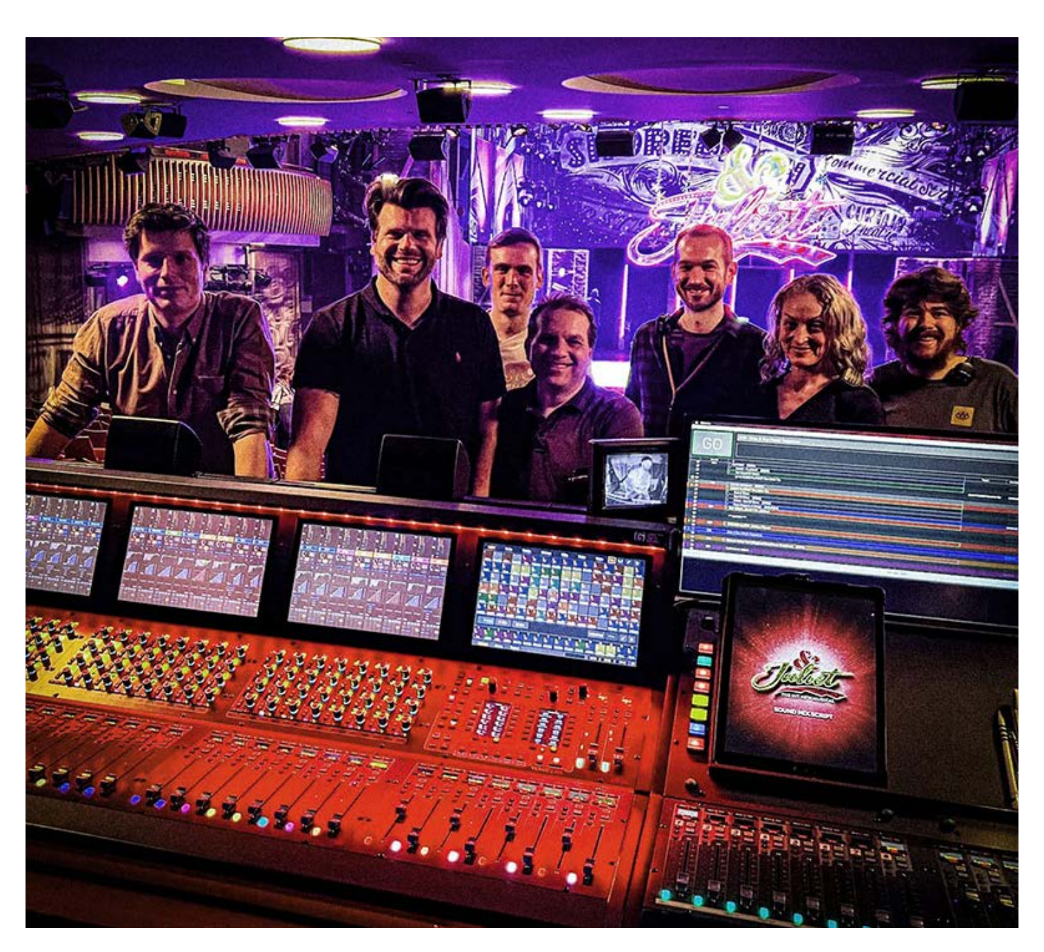
The & JULIET audio crew pose near the Avid S6L FOH console.